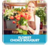
FLORIST CHOICE BOUQUET